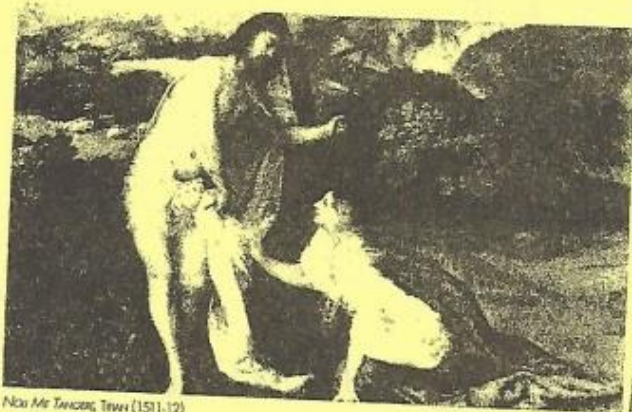
Noli Me Tangere, Tassi (1511-12)