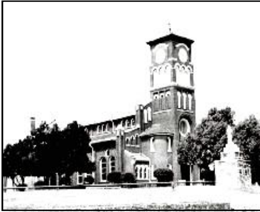
St. Mary's Catholic Church Windthorst, TX